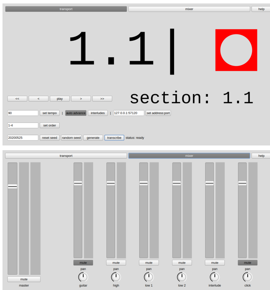
application user interface

The generation of this document (using LaTeX) contains a version date at the bottom of this page in order to help track changes and the git repository will also detail commit changes. The piece was written using SuperCollider version 3.11.0 and Lilypond version 2.18.83.